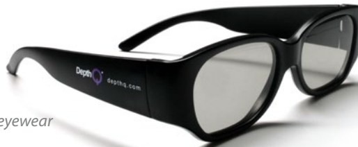
Uses lightweight passive 3D eyewear

DepthQ® Mobile™ utilizes a 47" diagonal HD 3D passive LCD monitor. This state-of-the-art stereoscopic display device provides high-quality, high-resolution flicker-free 3D imaging using comfortable and lightweight polarized 3D eyewear.